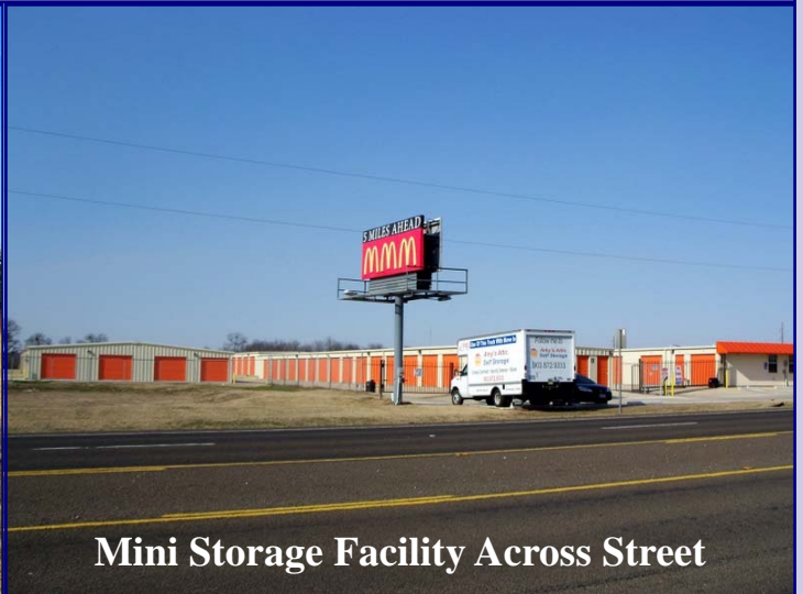
Mini Storage Facility Across Street