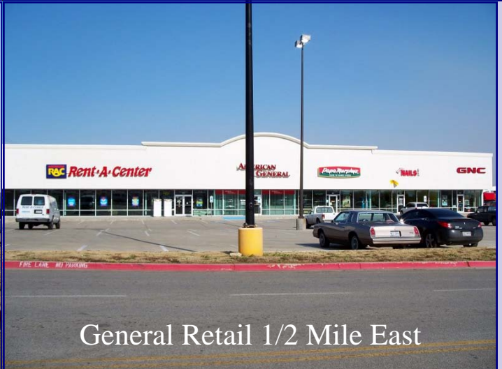
General Retail 1/2 Mile East

15.98 Acres on Hwy 31, approx 1/2 mile west of Super WalMart in Corsicana, TX. Next door to American RV Park. Has approx 5 acre trophy Bass lake. Zoned Commercial in Front, Ag in back. City of Corsicana is flexible on re-zoning to your use. All utilities available. 650 ft of Frontage on Hwy 31.