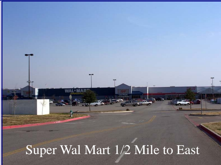
Super Wal Mart 1/2 Mile to East