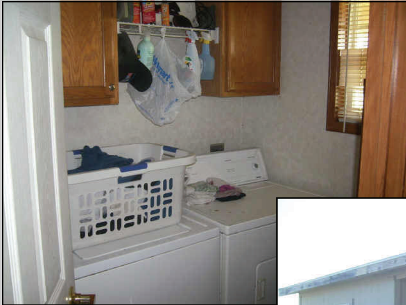
Nice size utility room with Full size washer/dryer hookup