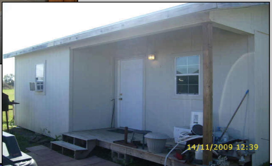
16 x 24 Workshop with AC, Water and Electricity.